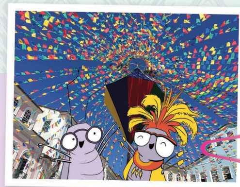
↪ ✨Salvador, Bahia - CARNAVAL! ✨